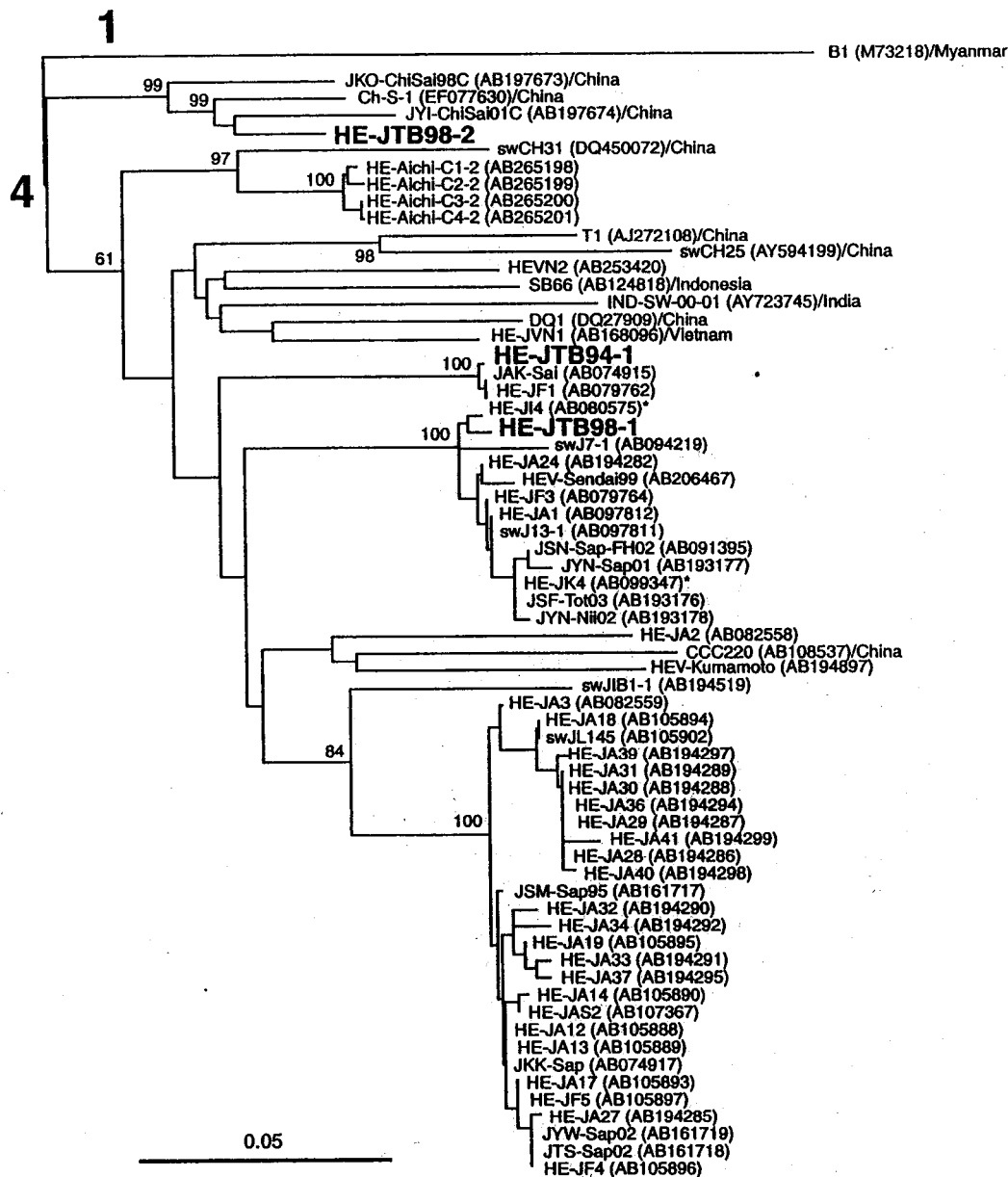
Fig. 2. Phylogenetic tree constructed by the neighbor-joining method based on the partial nucleotide sequence of the ORF2 region (412 nt) of 65 HEV isolates, using a genotype 1 HEV (M73218) as an outgroup. In addition to the HE-JTB94-1, HE-JTB98-1, and HE-JTB98-2 isolates found in the present study, which are indicated in bold type, 61 reported HEV isolates of genotype 4, whose common 412-nt sequence is known, are included for comparison. The reported isolates are indicated with the accession no. followed by the name of the country where it was isolated (non-Japanese origin only). An asterisk denotes human HEV strains that were isolated in the same prefecture as those obtained in the present study. Bootstrap values are indicated for the major nodes as a percentage obtained from 1000 resamplings of the data

mans, swine and wild boars, supporting the indigenous nature of these 8 blood donor isolates (Fig. 1). On the other hand, the remaining three