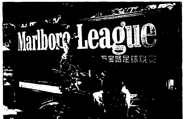
In Puerto Rico, China (above), and Venezuela, the cost of smoking has been estimated as 0.3%-0.43% of the gross domestic product

Passive smoking causes illness and premature loss of life, at all ages from the prenatal period to late adult life